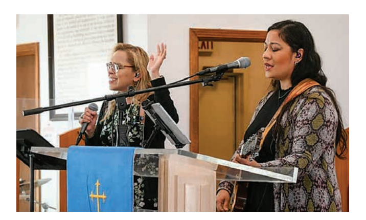
El Paso women. On March 9, women from the Tree of Life church in El Paso, TX, held a service to honor the Women's Emphasis theme. They enjoyed beautiful worship and fellowship and focused on how to be transformed in the eyes of God.

more attended and enjoyed wonderful worship. They all returned to their congregations motivated and willing to serve the Lord. The three sermons inspired the men to continue making themselves available for the work of the Lord, for visitors, for fellow ministers, and for those the Lord will call to His vineyard.