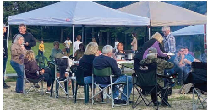
Campout. The annual campout, hosted by the Parkland congregation, took place July 28-30. Despite the lower-than-expected turnout, the district members enjoyed a Spirit-filled family time on the vast, lush Parkland church grounds. The celebratory and worshipful atmosphere could not be contained.