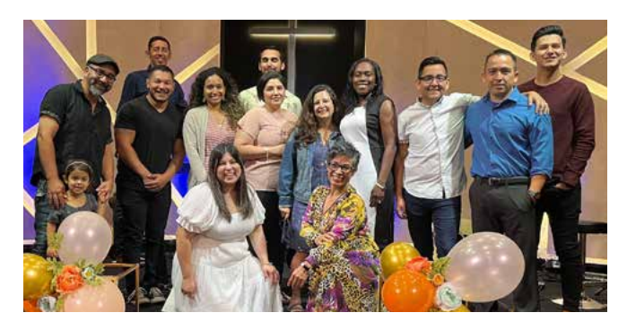
Celebration. On May 14, our sister church, New Hope United, celebrated ten years of God's grace in their midst. The congregation enjoyed a blessed service and message, as well as a time of fellowship. We praise the Lord for His faithfulness!