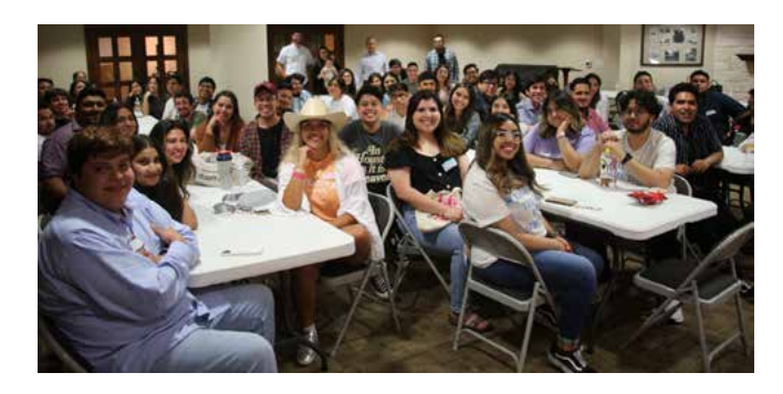
SWORD joy. More than 100 young adults gathered at the CoG7 Truevine in Austin, TX, on May 21. During the day, the young adults learned about the joy they can find in such areas as evangelism, finances, fellowship, relationships, and worship. The day was full of activities, games, and most important, God's presence.