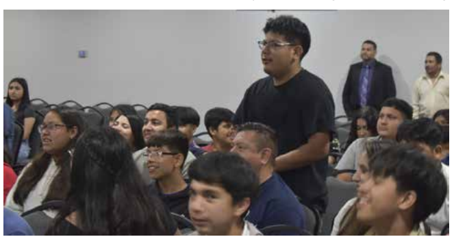
Area 3 worship. The doors of the Eperanza Viva church in Houston opened to 85 youth and young adults on April 30 for a worship night. The message encouraged them to remember the special place God has given each one of them. During the night, all of the youth and young adults praised, learned, and fellowshipped together.