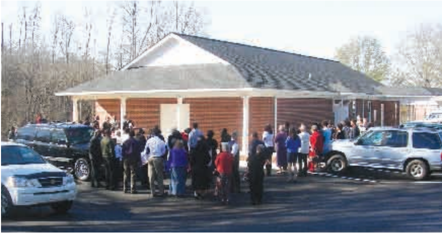
Ribbon-cutting ceremony prior to dedication service of Newton, NC, church. See additional photos in Churchright Online.