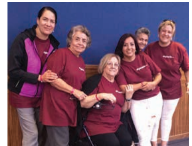
Ladies from California, Texas, Mexico, and Argentina at the women's congress in Mexico.