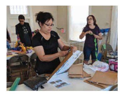
Preparing for ministry. On May 20 members of the El Paso Central congregation gathered to prepare for their Bible Summer School, scheduled for July 23 27. Some also came to Extend Your Hand, a

group of members who do repairs and extensive cleaning in the church every month.