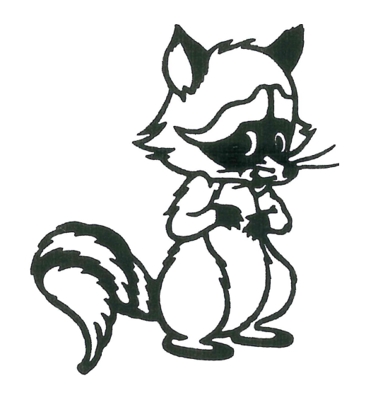
My Seekers Leaders are